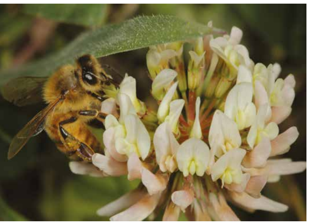
Figure 3: White clover flowers are oriented facing up and horizontally, and every floret in the flower head has pollen.