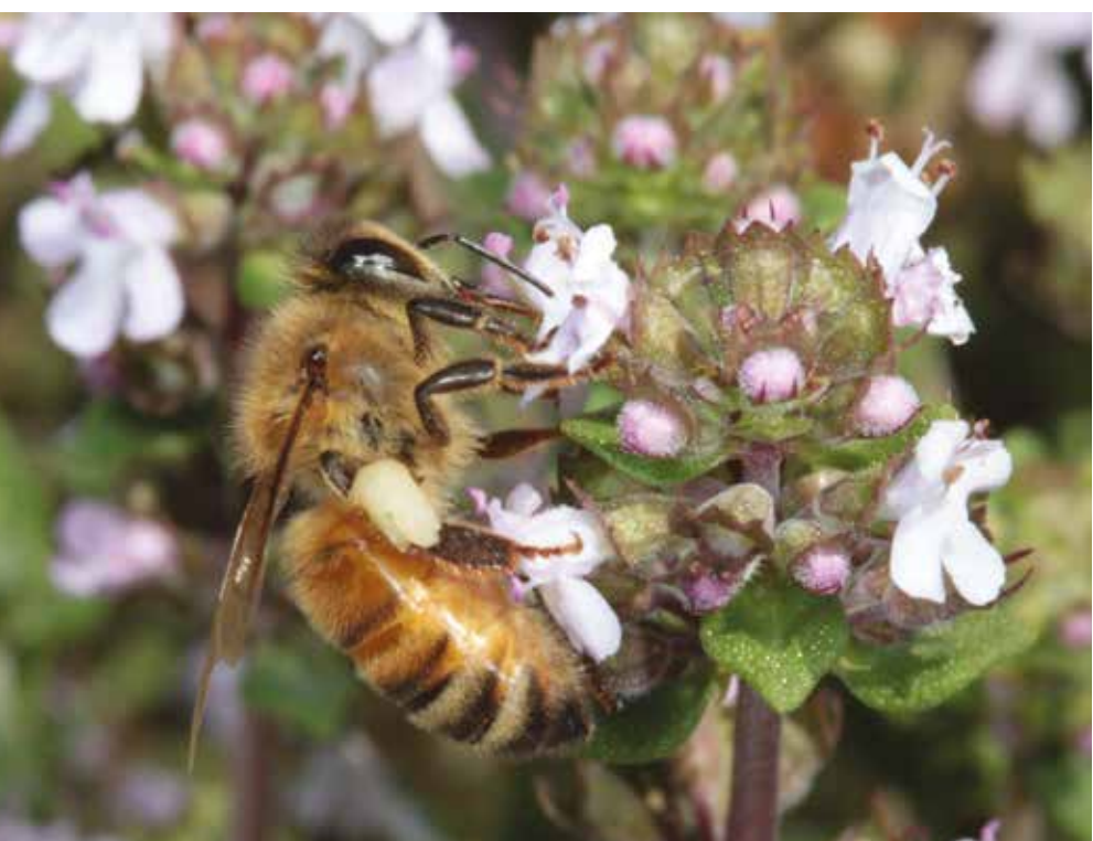
Figure 4. Thyme flowers are oriented facing up and horizontally, but not every plant has flowers with pollen because a portion of them will be female plants with flowers lacking pollen.

reproductive parts both in one flower). The female plant and bisexual plant both produce nectar. On the female plant, there are different types of female flowers with some having no anthers at all (i.e., no pollen) and others with atrophied anthers and aborted pollen grains.